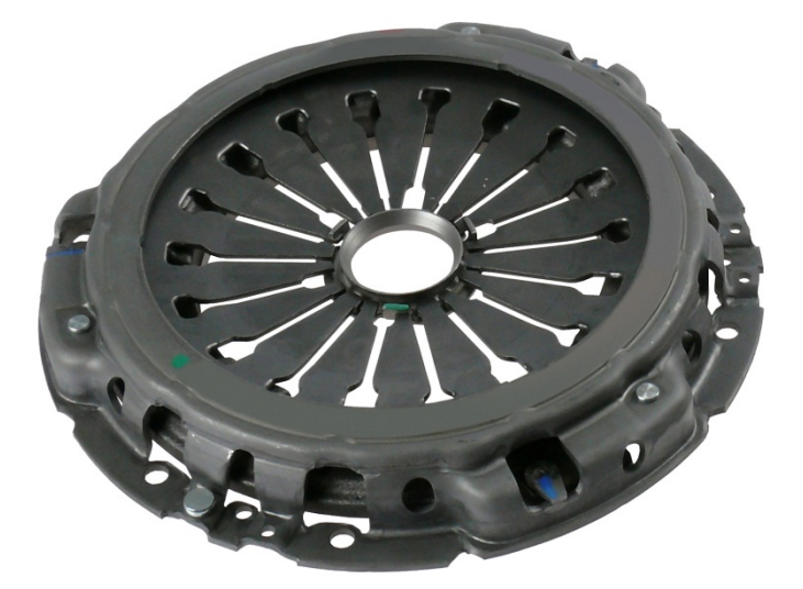
Fig. 1: Pressure plate, pull-type version