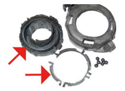
Fig. 4: Mechanical damage and overheating on the releaser