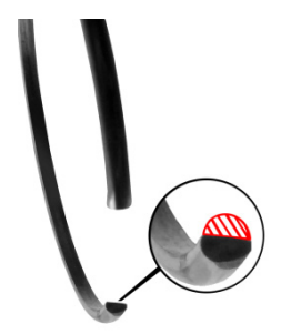
Fig. 3: Worn retaining ring. Consequence: Releaser will separate from the diaphragm spring → sudden clutch engagement